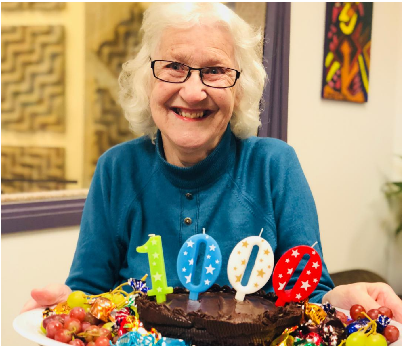
Sheila Shuttlebus Half Hour - 11am Mondays / 11pm Tuesdays

See inside for 100+ extra OARdinary Dunedin-made Shows